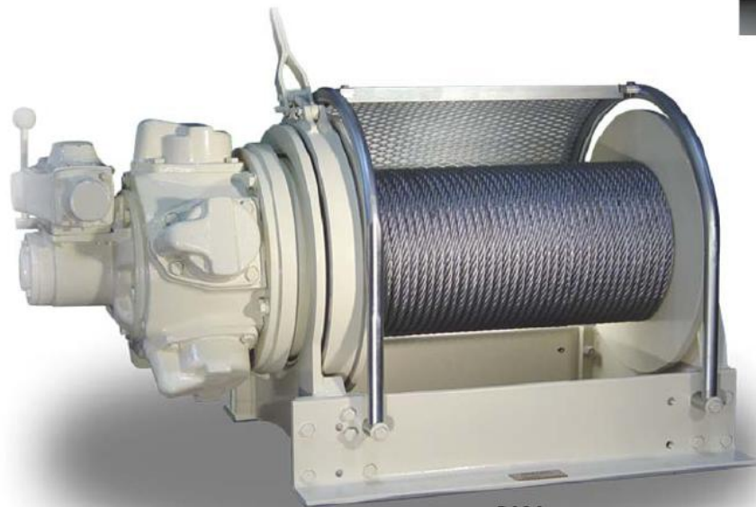
BA3A With Drum Guard & Band-brake